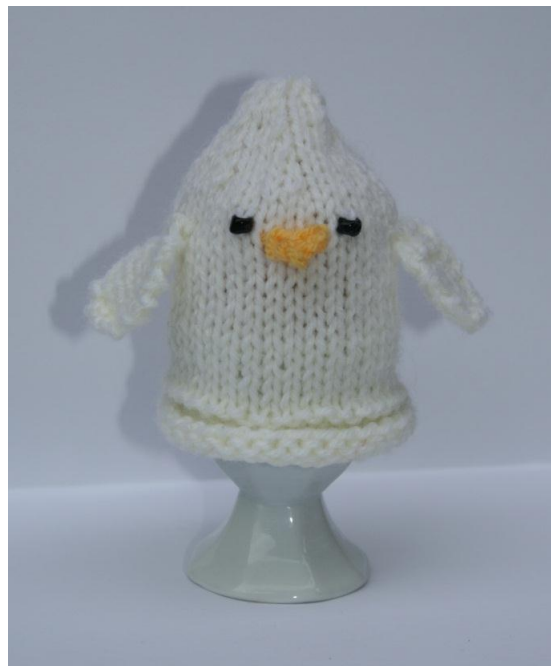
MC – Cream, Beak – Gold

For this chick follow the instructions as previously, using Cream as MC and Gold for the beak.