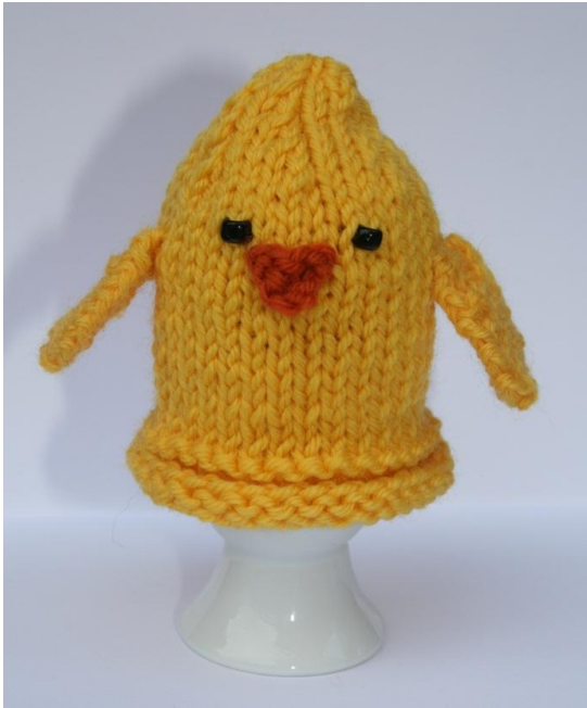
MC – Gold, Beak – Copper

Using 4mm/US 6 needles and MC, cast on 35 sts.